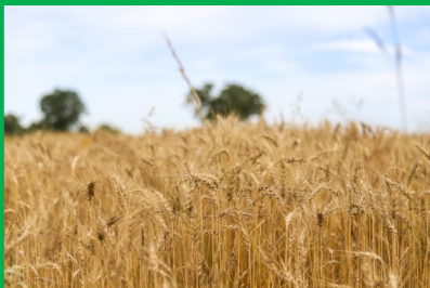
Harvesting Organic Wheat